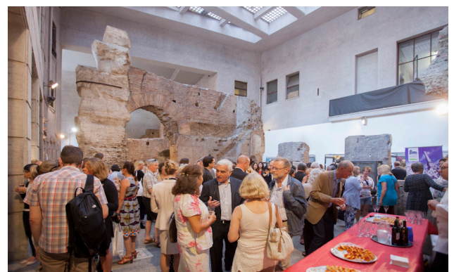
Welcome reception – Stadio di Domiziano, Piazza Navona